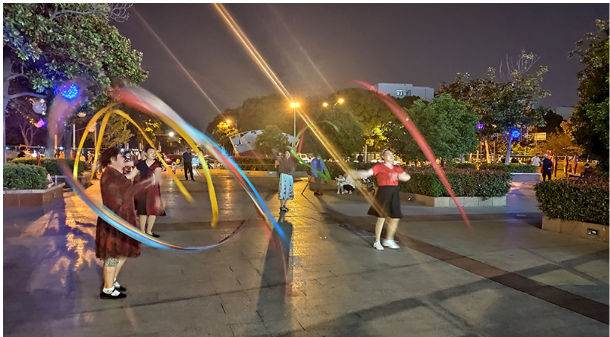
Figure 3: Groups of dancers with ribbons at Hanlin square in Suzhou Industrial Park. Photo by Claudia Westermann, September 2022.

When I arrive, there are three groups . All groups dance in lines. A battery-powered speaker placed in the front of each provides the music. Each group has its own selection of songs. The group of dancers closest to the street appears to be the most organized. At times the dancers use props. This group has folding fans; another has ribbons (Figure 3). Later in the evening, the group next to the market dissolves its lines and engages for the next hour in a form of ballroom dancing. Line dancing is pái wǔ (排舞). Ballroom dancing is jiāoyì wǔ (交谊舞). Between the groups, a man practises Tai Chi. Some children run after a ball. At the plaza's north entrance, a man has placed a mobile karaoke station. Some passers-by stop and sing.