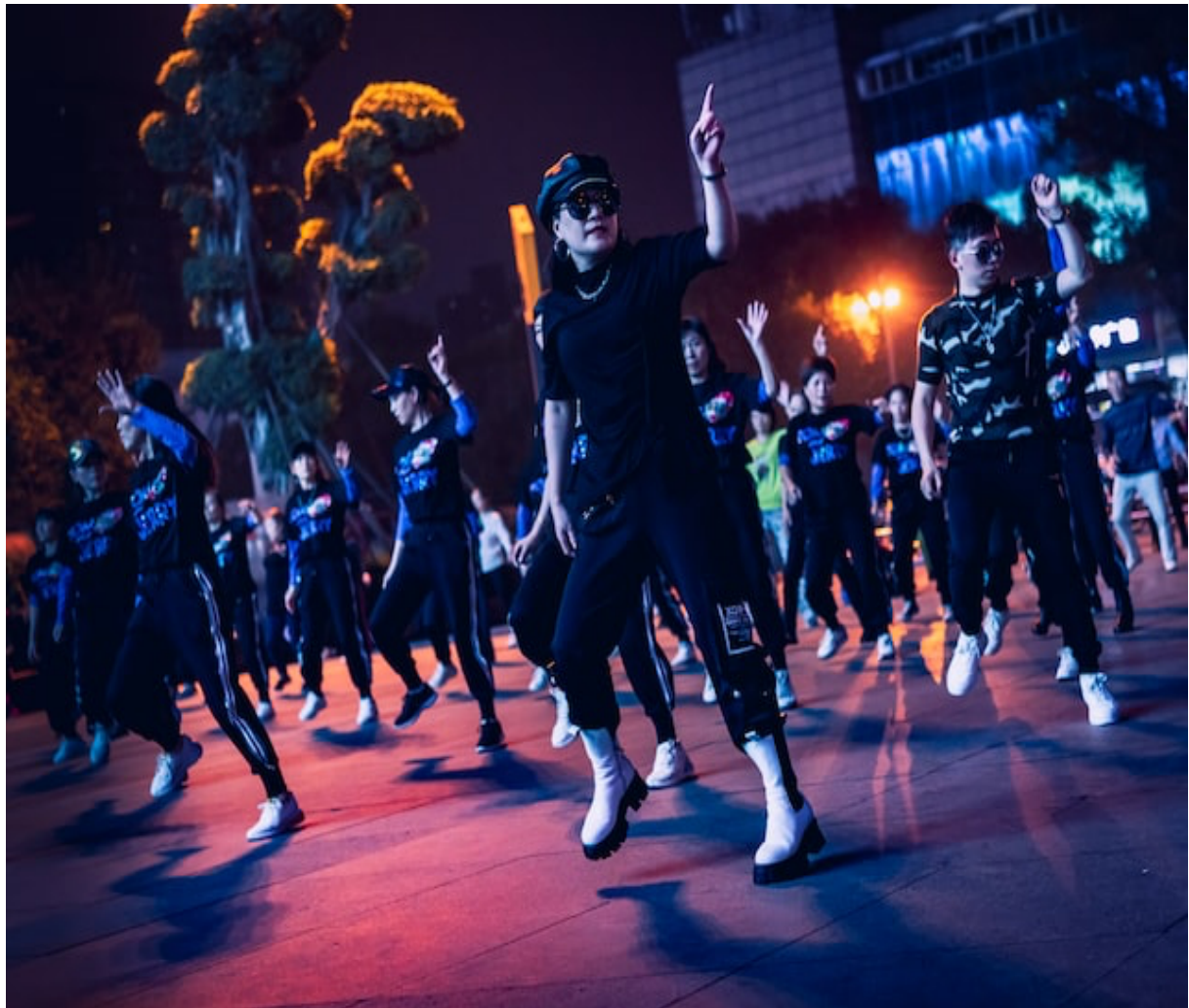
Figure 4: Young urbanites dancing on a public square. Photo by Li Lin (northwoodn) via Unsplash, 10 November 2020. Public domain.

Public square dancing (广场舞, guǎngchǎng wǔ ) is ubiquitous in China (Xu and Tian 2017). As the narrative in the previous paragraph highlights, it has nothing to do with the so-called square dance that has its roots in the United States and was highly popular among teenagers in the 1980s. China's public square dancing is not a teenage sport, even though recently, it has gained popularity among the younger generation as a magazine edited by undergraduates of Duke University highlights (Huang 2021) (Figure 4). Typically practised in the morning or evening hours, public square dancing has engaged mostly female performers in their pension age – in China, 'pension age' means females older than 50 and males older than 55. Public square dancing is a mix of exercise for health and personal pleasure and competitive performance for an audience (Seetoo and Zou 2016: 24). Dance groups can vary in size, from just a few dancers to very large groups. Reflecting the traditional guānxi model, there is always a dance leader (領舞, lǐngwǔ ), who is not only the dance teacher but also the person who negotiates with the local community. As research shows, dance leaders often have extensive experience in collective and competitive practices of the pre-opening-up period (Seetoo and Zou 2016; Martin and Chen 2020).