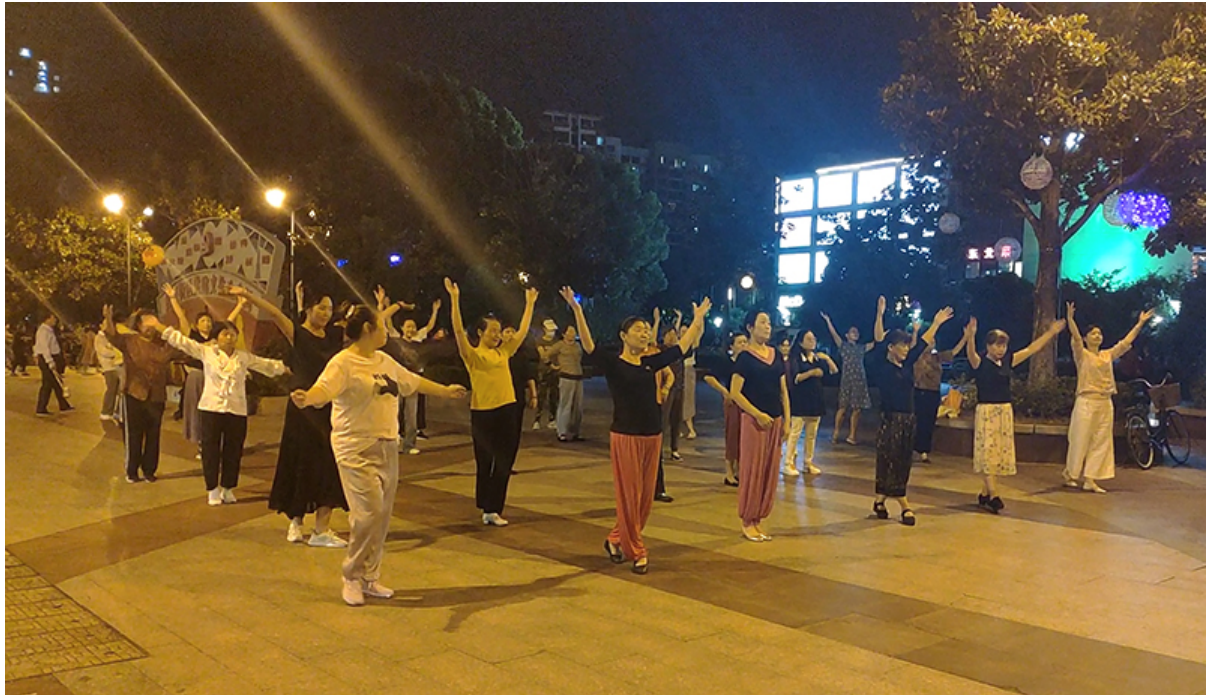
Figure 1: Dancers at Hanlin Plaza in Suzhou Industrial Park. Photo by Claudia Westermann, September 2022.

skateparks when the 2020 Olympic Games hosted skateboarding for the first time in history (Li 2022; Du and Wu 2021).